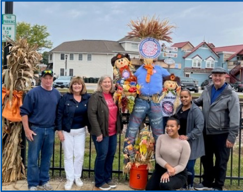
Palatine Township won 3rd Place in the Palatine Scarecrows on Parade contest

Palatine Township strives to build better connections with our community and agency partners.