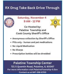
Palatine Township and Cook County Sheriff's Office Co-Hosted the Rx Drug Take Back Event