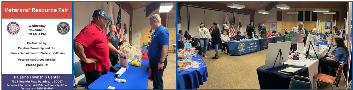
Veterans' Resource Fair Co-Sponsored by Palatine Township and Illinois Department of Veterans' Affairs

We host outreach programs, participate in community events, inform residents of services and receive the support of community leaders.