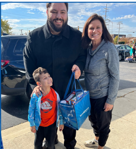
St. Nectarios Greek Orthodox Church Project Hope provided 250 pre-packed bags for the Palatine Township Food Pantry