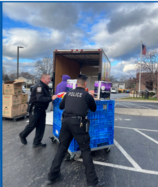
"Fill the Humvee" Food Drive Palatine Township and Rolling Meadows Police Department