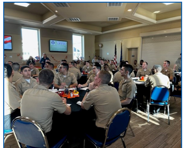
Palatine Township and American Legion Thanksgiving Day