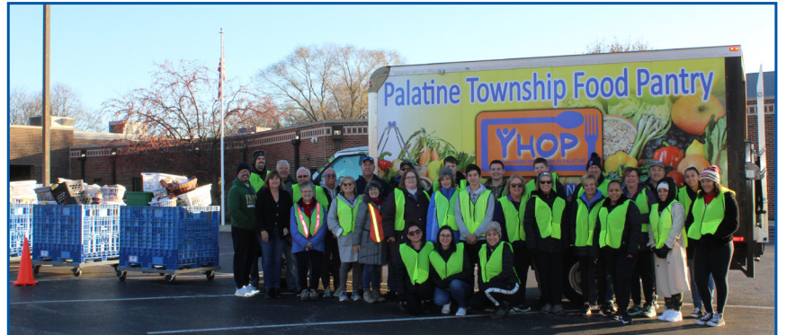
Palatine Thanksgiving Basket Program Thank you to the generous donors, our dedicated staff and the amazing volunteers who made this a success