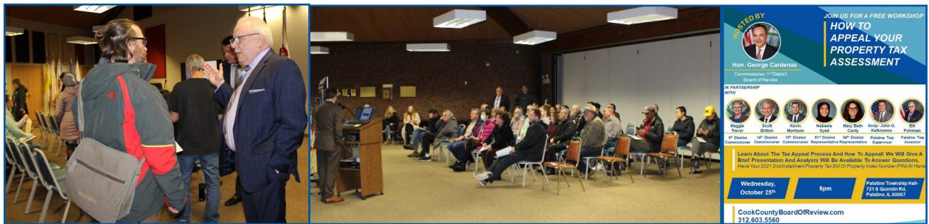
Palatine Township and Cook County Board of Review co-sponsored "How to Appeal Your Property Tax Assessment" Assessor's Workshop