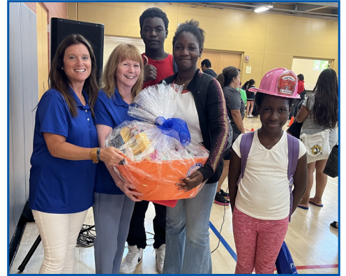
Better Together Resource Fair at Falcon Park Raffle Winners