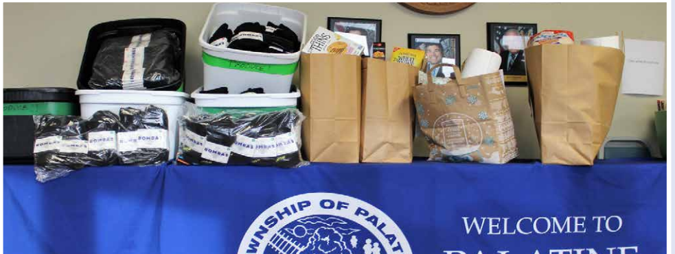
Palatine Township is now a Giving Partner with Bombas socks. We applied for and received thousands of socks that we are distributing to our Food Pantry families.