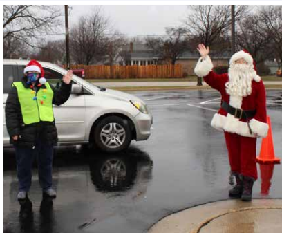
Special helpers that came to distribute Adopt-A-Family gifts.