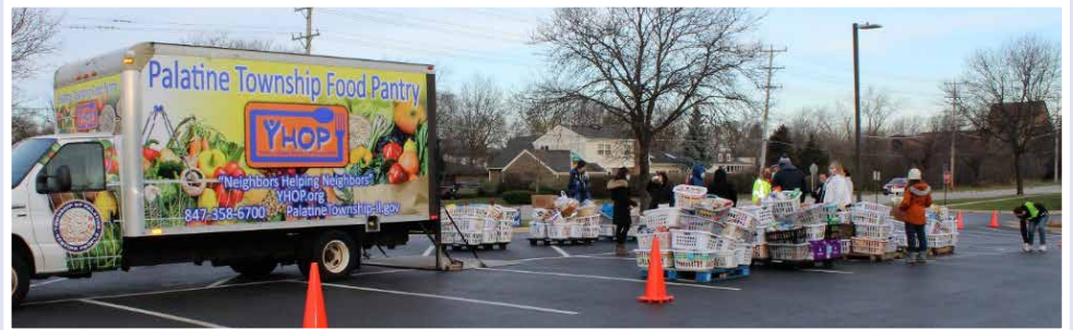
Getting ready to distribute Thanksgiving Baskets.