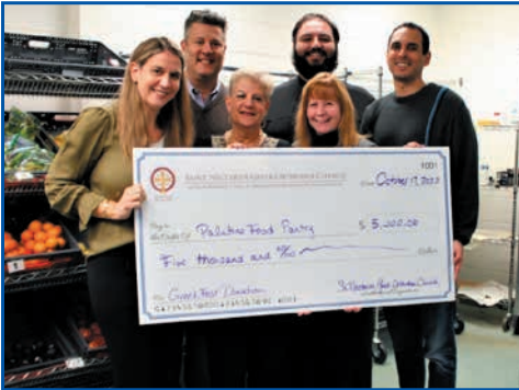
Saint Nectarios Greek Orthodox Church donation to the Palatine Township Food Pantry of $5,000

Palatine Township strives to build better connections with our community and agency partners.