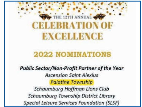
We were honored to be nominated for Community Organization of the Year for the Palatine Chamber of Commerce and Public Sector/Non-Profit Partner for the Hoffman Estates Chamber of Commerce for our service to the community.