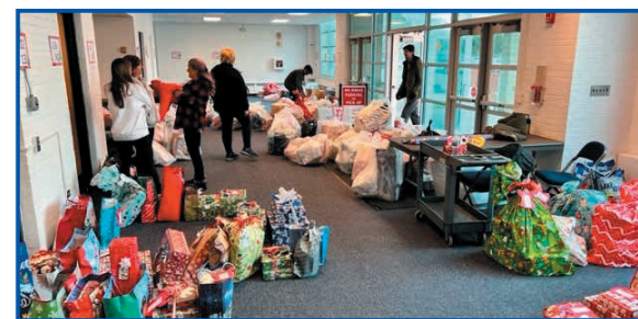
Christmas gifts delivered to the Early Childhood Developmental Enrichment Center (ECDEC) for our Angel Tree Program