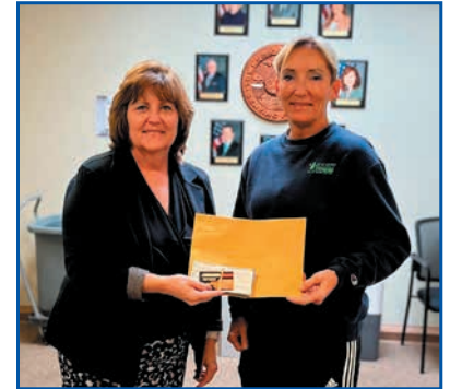
Thank you to Hawk Fitness for your donation to the Palatine Township Food Pantry