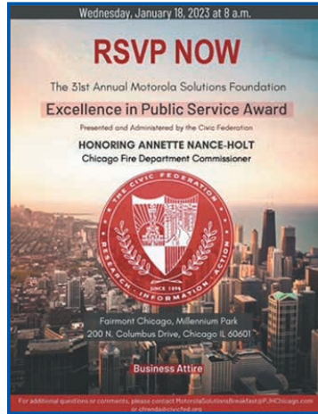
Attending the Excellence in Public Service Award along with Fire Chiefs from the Northwestern suburbs