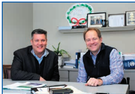
Honored to work with Senator Dan McConchie