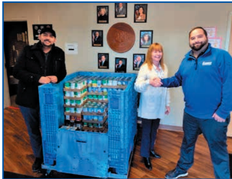
Thank you to Leader Automotive for your generous food drive