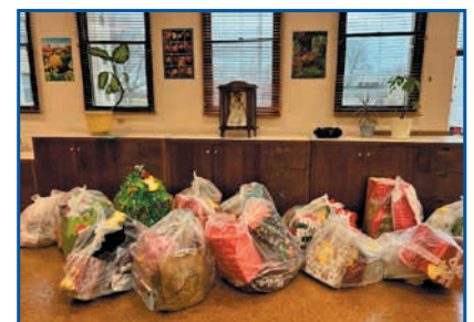
Angel Tree gifts delivered to the seniors at Greencastle of Palatine