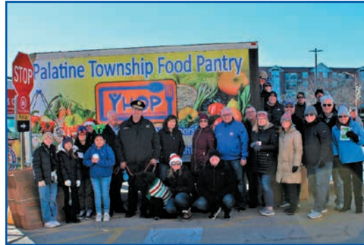
2022 Rolling Meadows Police Department Annual Holiday Food Drive collection for Palatine Township Food Pantry