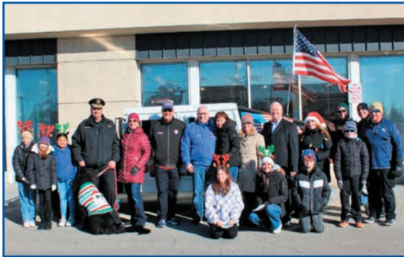
Working together with the Rolling Meadows Police Department and the Palatine Township Board and Staff. A special Thank You to the #KindnessKrew students at Community Consolidated School District 15 Central Road Elementary for volunteering.

We host outreach programs, participate in community events, inform residents of services and receive the support of community leaders.