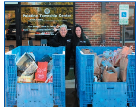
@Properties dropping off donations to our Palatine Township Food Pantry