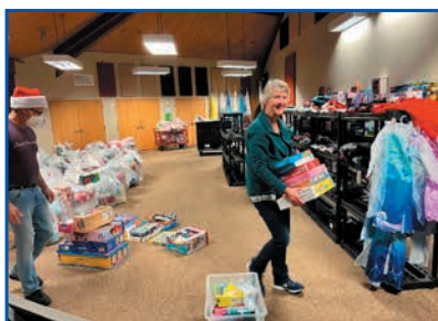
Generous volunteers sorting gifts donated to our Toy Drive