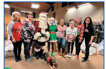
A special visit from Santa, a Christmas elf and Max the Dog helping our volunteers distribute holiday gifts