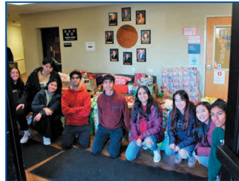
Palatine High School students donated gifts to the Angel Tree program!