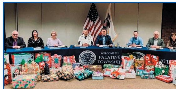
Our Township Board surrounded by gifts donated for children by our generous Township residents