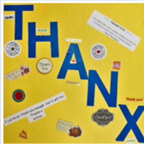
We get encouragement from our donors!