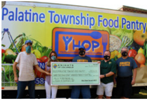
Donation from the Knights of Columbus #4977