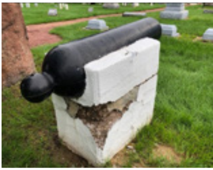
CANNON IN DISREPAIR

The historic cannon at Hillside Cemetery was saved thanks to a collaborative effort between the Palatine Township Cemetery Committee, The Palatine Historical Society, The Palatine Road District and several outstanding commercial businesses in Palatine Township.