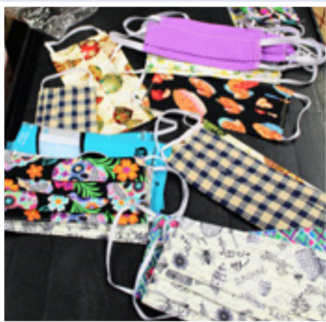
More homemade masks donated to the Township.