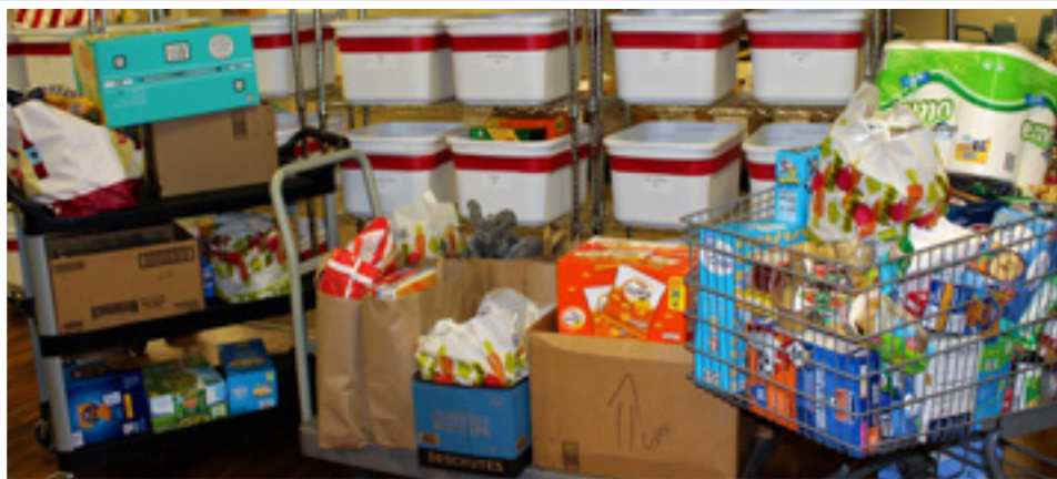
A Facebook Group held an anonymous food drive. They donated all these groceries with checks and gift cards!